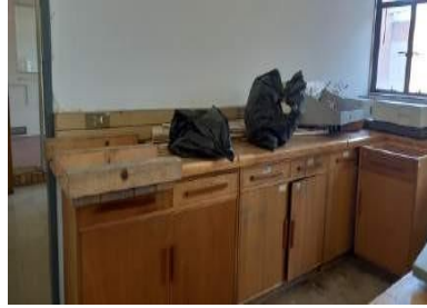
Remove existing cupboards