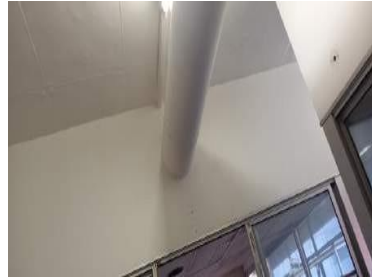
Remove existing overhead pipe and make good