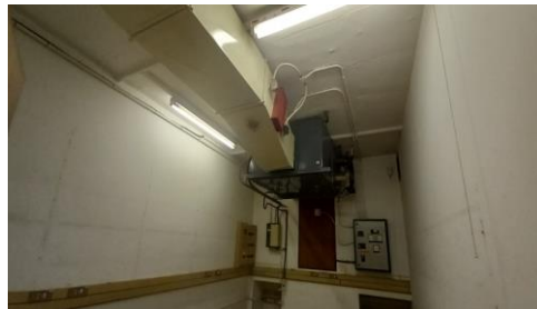
Remove redundant laboratory infrastructure