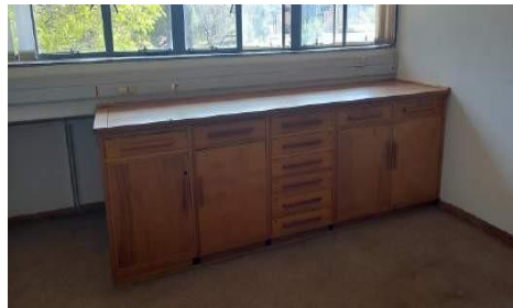
Floor cupboard to be replaced