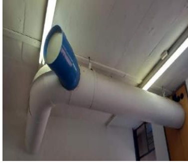
Remove existing redundant laboratory infrastructure and make walls good