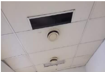
Remove existing ceiling