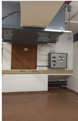
Remove existing redundant lab infrastructure and make walls good