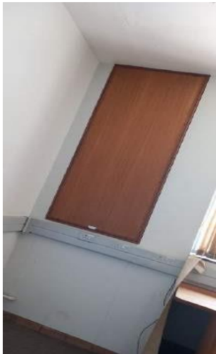
Service doors to be replaced to match floor cupboards