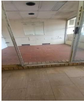
Remove existing shopfronts and break the platform to level the floor