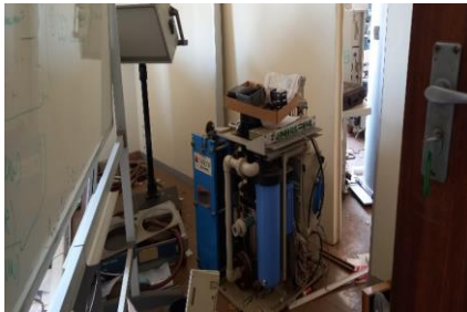
Remove existing equipment and cart off site